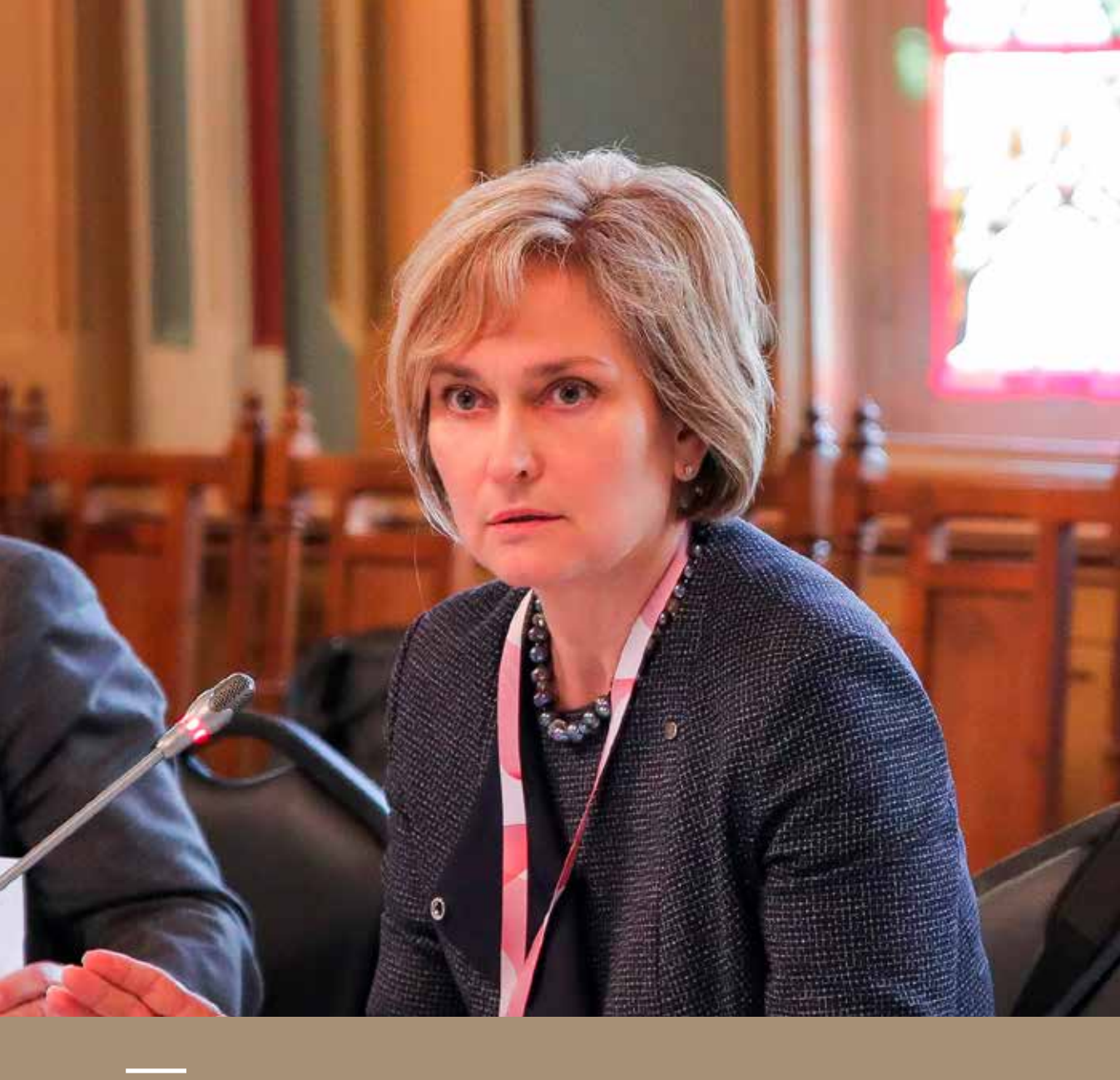
Ms Ineta Ziemele Judge at the Court of Justice of the European Union